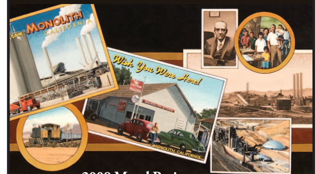
2008 Mural Project

Join us for an educational and fun-filled weekend!